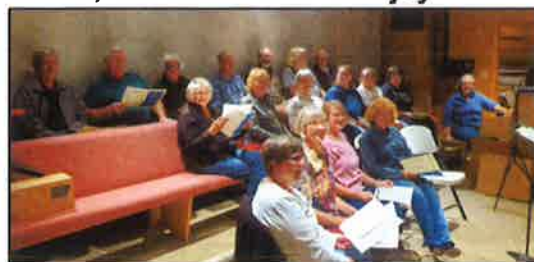
The St. Peter Choir excited to begin practicing once again