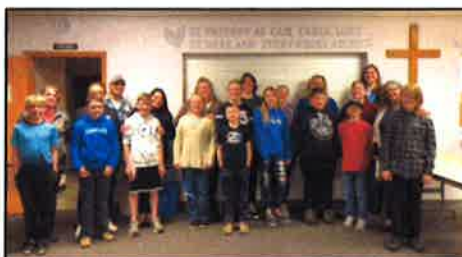
First Communion Retreat at St. Peter