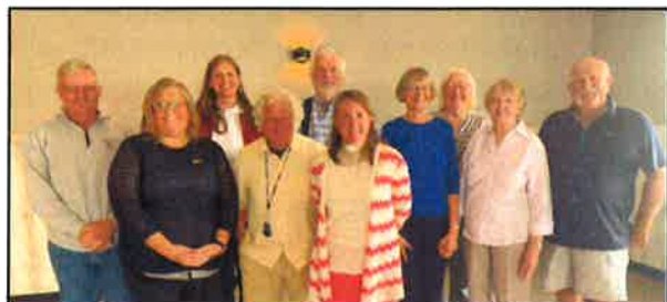
Mutual Ministry Committee Retreat on August 21 st