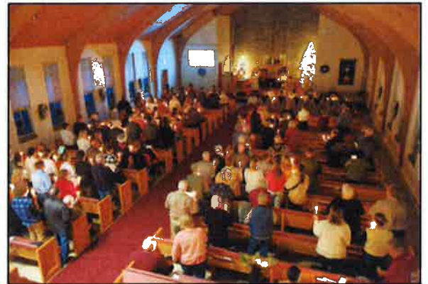
4:00 p.m. Worship on Christmas Eve 2022