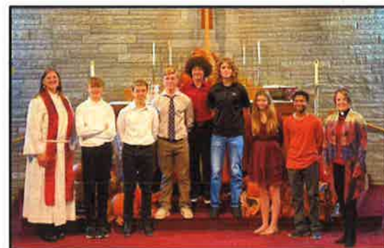
2022 Youth Affirming Their Faith