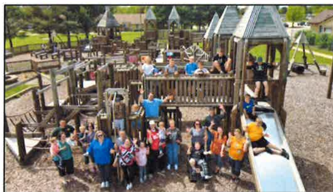
Sunday School Ministry Picnic at Fort Fun