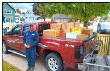
Quilts for Lutheran World Relief