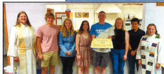
2022 Graduate Recognition. The Seniors helped other High School students to lead worship as well.