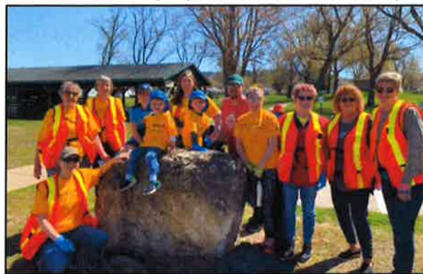
"God's Work. Our Hands." Day of Serving.