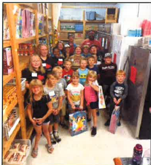
VBS Youth Serving at Coulee Cap