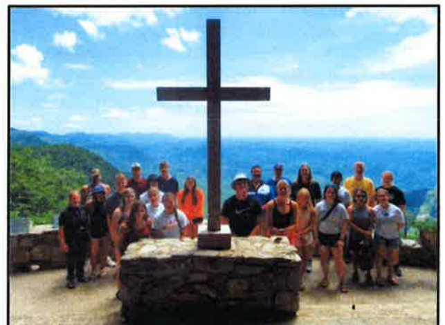
High School Mission Trip Summer 2022

Thank you for your amazing generosity as you helped to send our students on the High School Mission Trip to Savannah, GA (July 22-30). It was a wonderful week of travel, service, mission, learning, and sharing God's Love.