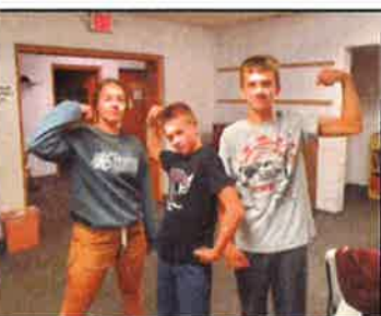
Confirmation Ministry Service Night